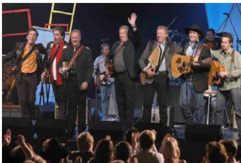
CCMA 2004 Awards Show—Roots Segment: All Artists

Danzinger & Hochman . . . an accounting firm in Toronto, has been providing services to the Awards Committee of the Canadian Country Music Association (CCMA) over the last six years. The CCMA hosts the annual Canadian Country Music Awards Show that recognizes top artists for their contributions to country music in Canada.